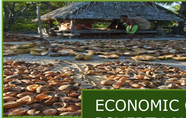
ECONOMIC GROWTH & POVERTY ALLEVIATION