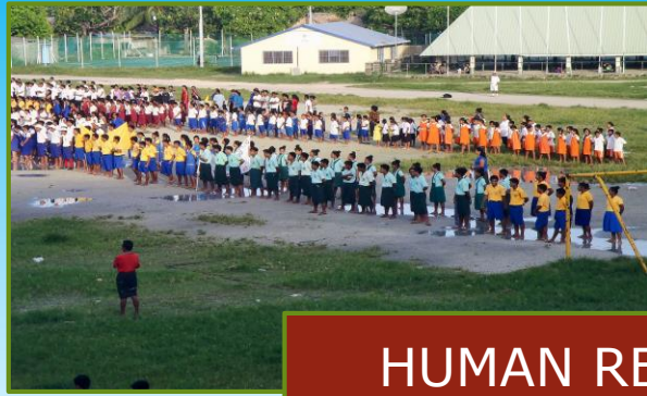
HUMAN RESOURCE DEVELOPMENT