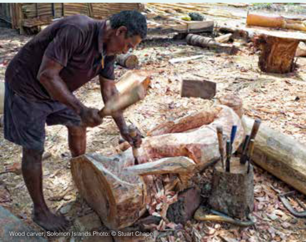
Wood carver, Solomon Islands.