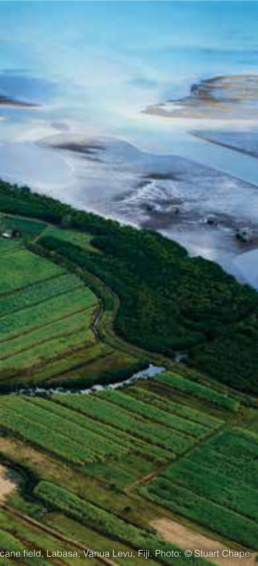
cane field, Labasa, Vanua Levu, Fiji.