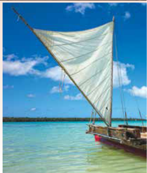
Canoe, New Caledonia.

S PREP approaches the environmental challenges faced by the Pacific guided by four simple values. These values guide all aspects of our work.