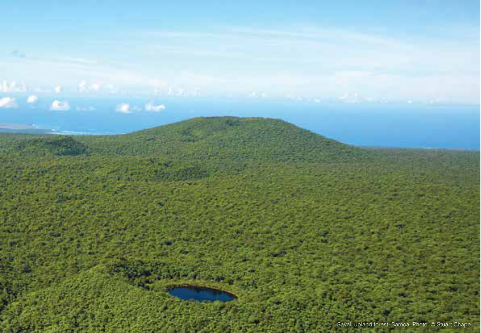
Savaii upland forest, Samoa.