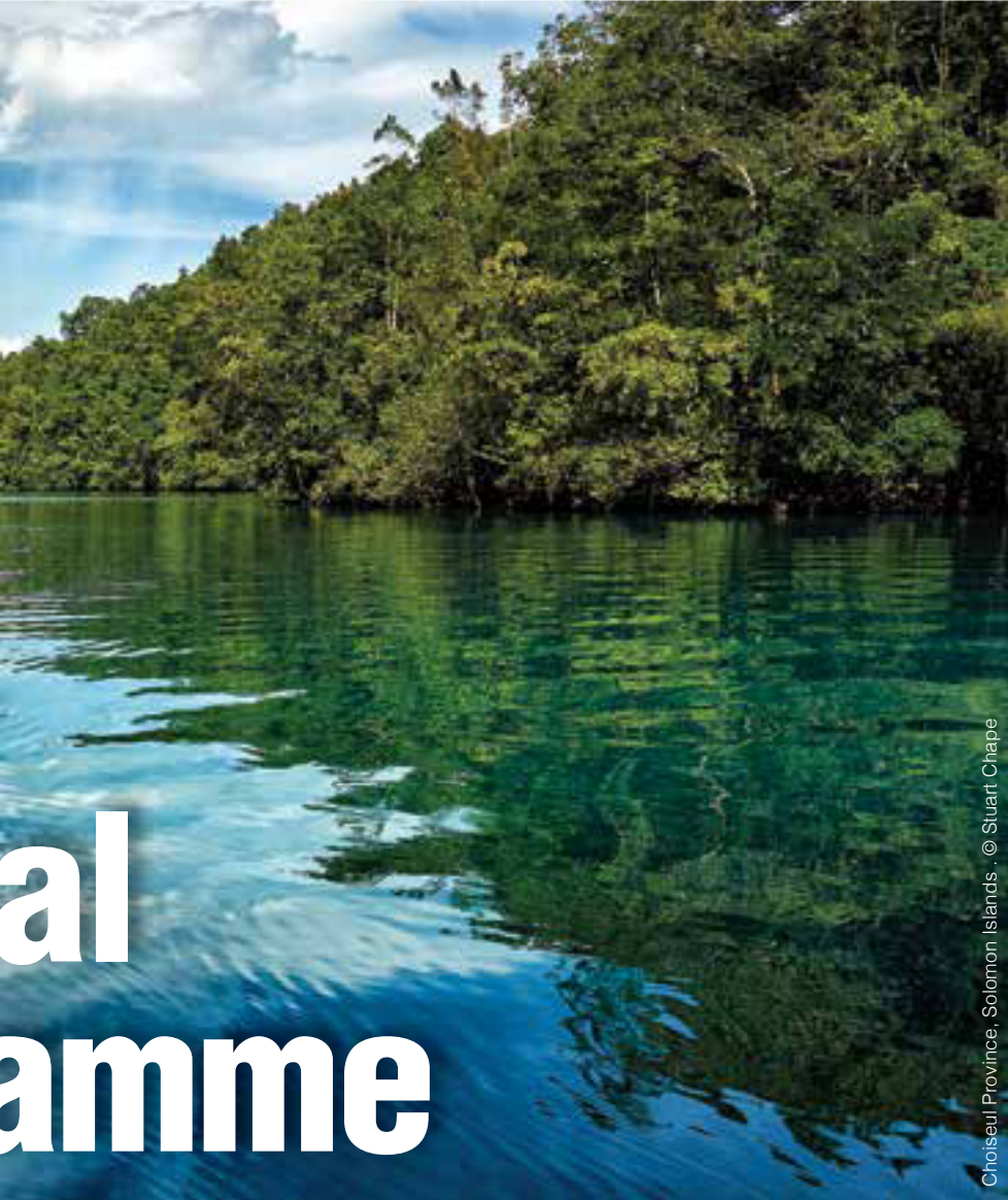
Choiseul Province, Solomon Islands.