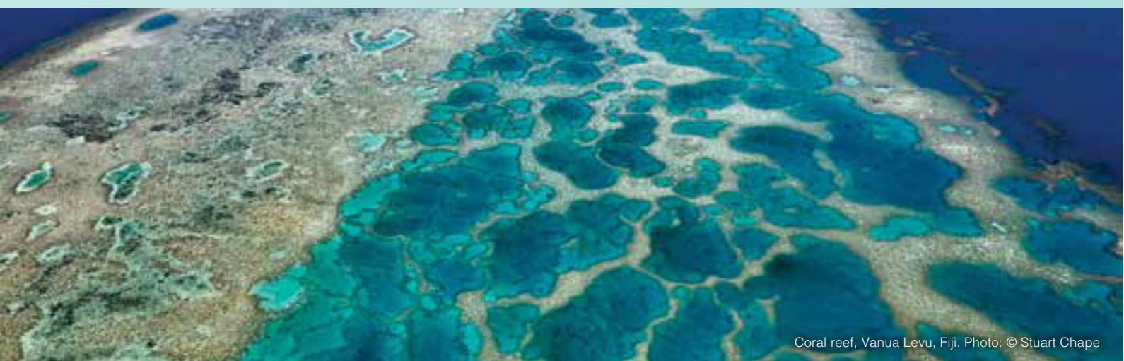
Coral reef, Vanua Levu, Fiji.

The Secretariat hosts technical expertise in a wide range of oceans issues. In anticipation of the increasing severity of ocean ecosystem impacts, especially from climate change, SPREP is committed to increasing its capacity to address ocean issues and to collaborating with Members, CROP agencies, and supporters to protect the health and resilience of our ocean for the benefit of SPREP Members and future generations.