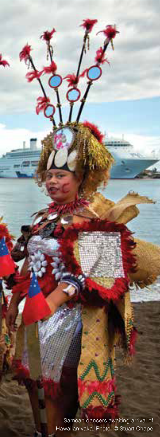
Samoan dancers awaiting arrival of Hawaiian vaka.