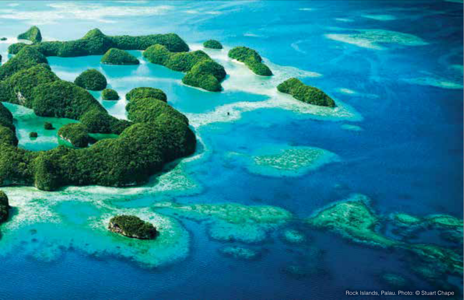
Rock Islands, Palau.

coordinated regional responses to global issues and international agreements.