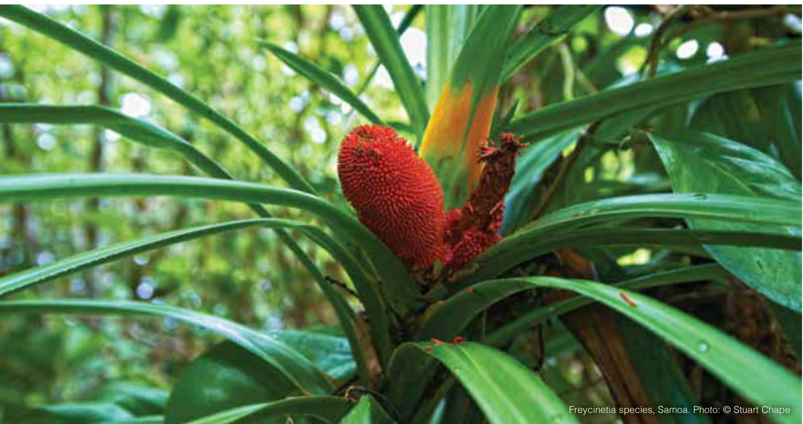
Freycinetia species, Samoa.

2.4 Significantly reduce the socio-economic and ecological impact of invasive species on land and water ecosystems and control or eradicate priority species.