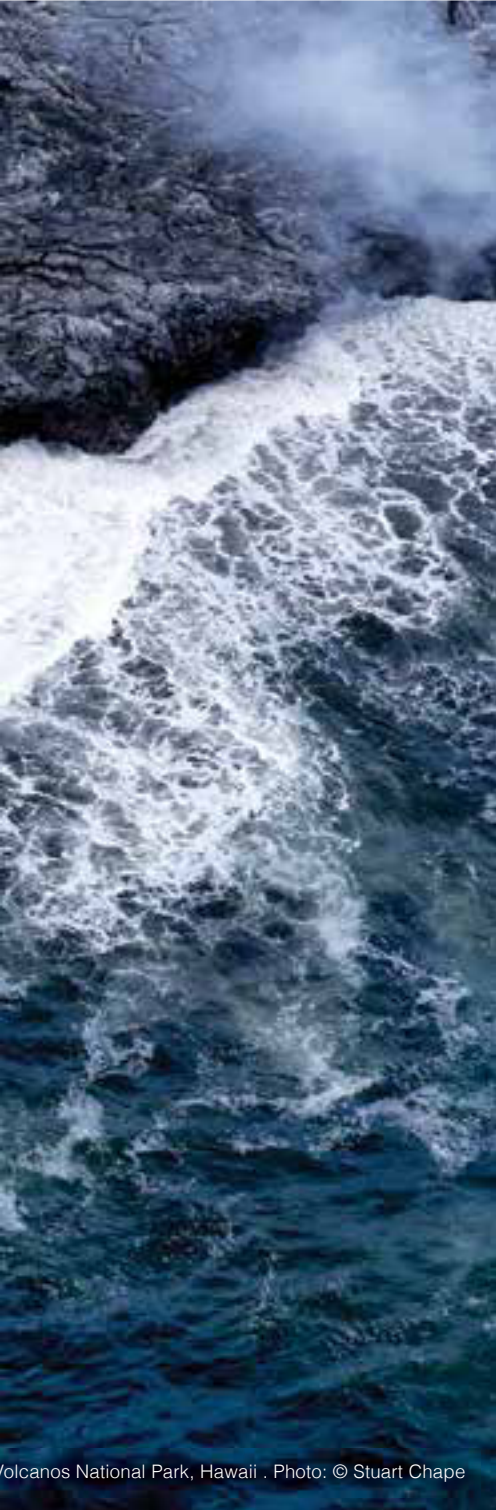
Volcanos National Park, Hawaii .

REGIONAL GOAL 1: Pacific people benefit from strengthened resilience to climate change